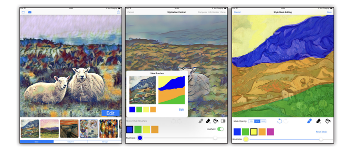
Figure 2: App screens for selecting a NST technique and locally applying (sub-) styles to a content image.

The first prototype was based on design choices to achieve a high learnability of the system and the reduction of error sources. We decided to focus the usability design on the definition of sub-style brushes, since this approach addresses the most complex challenges that need to be solved to clearly communicate functionalities to endusers. These include: (a) how to define sub-style brushes as a user, (b) how to visualize pre-defined and user-defined sub-style brushes of a style image and (c) how to apply different sub-style brushes to a content image. The app provides style images with pre-defined sub-style brushes for all three techniques, visualized through color mappings. Users can draw masks to define new brushes and then draw content masks to spatially direct the style application (Figure 2). In addition, we propose a two-tiered approach to ensure an interactive editing and a better imagination of the stylized output: first, users blend global stylizations in image space using interactive painting metaphors to preview the stylization; second, they can perform an on-demand stylization with the described feature space merging using either MSG or adaIn networks.