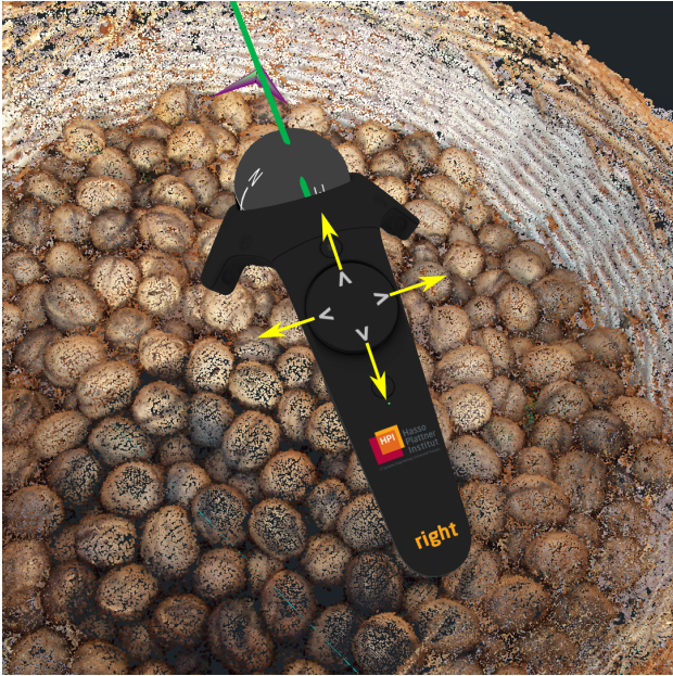
Figure 5. When pressing on the touchpad, the user can move in the selected direction relative to the forward direction symbolized by the green ray.