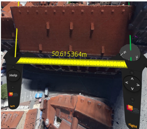
Figure 1. The virtual tape measure enables the user to take quick measurements in object space.

Emerging virtual reality (VR) technology allows immersively exploring digital 3D content on standard consumer hardware. Using in-situ or remote sensing technology, such content can be automatically derived from real-world sites. External memory algorithms allow for the non-immersive exploration of the resulting 3D point clouds on a diverse set of devices with vastly different rendering capabilities. Applications for VR environments raise additional challenges for those algorithms as they are highly sensitive towards visual artifacts that are typical for point cloud depictions (i.e., overdraw and underdraw), while simultaneously requiring higher frame rates (i.e., around 90 fps instead of 30 - 60 fps). We present a rendering system for the immersive exploration and inspection of massive 3D point clouds on state-of-the-art VR devices. Based on a multi-pass rendering pipeline, we combine point-based and image-based rendering techniques to simultaneously improve the rendering performance and the visual quality. A set of interaction and locomotion techniques allows users to inspect a 3D point cloud in detail, for example by measuring distances and areas or by scaling and rotating visualized data sets. All rendering, interaction and locomotion techniques can be selected and configured dynamically, allowing to adapt the rendering system to different use cases. Tests on data sets with up to 2.6 billion points show the feasibility and scalability of our approach.