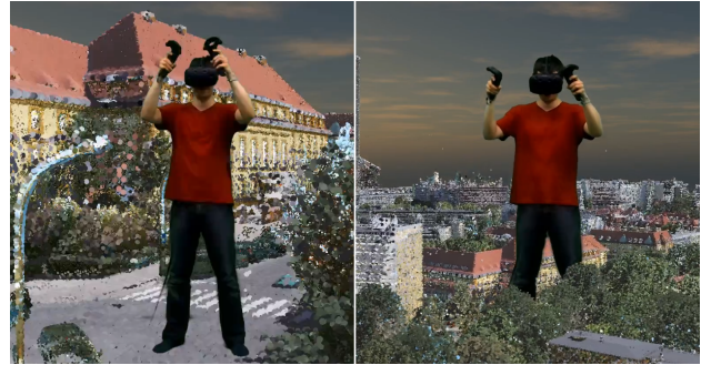
Figure 4. A gesture-based transformation tool allows to scale, translate and rotate 3D point clouds interactively.

one or both controllers by pressing the respective grip buttons. The grabbed objects can then be manipulated by performing gestures with the grabbing controllers. In this specific case, the following gestures are supported: