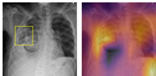
Figure 2: Chest X-ray with Pneumothorax (left), CNN Grad-CAM [3] (right) [4]