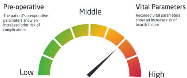
Figure 2: Calculating the risk of complication before an operation

In your master thesis, we want to you to discover the current best practices and using to develop a model which is able to accurately predict the probability of a complication. In order for the prediction system to be used in practice, we will also need a high degree of so-called