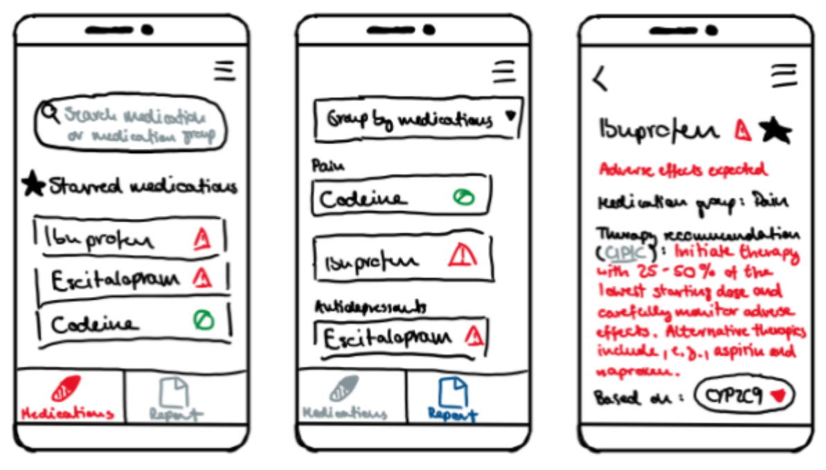
Figure 1. Mock-ups of how a user-facing pharmacogenomics app could look like.

Even in modern medicine, finding the right drug for a patient's personalized treatment sometimes follows a trial-and-error process: some medications work better than others or can cause serious side-effects. The decision of which drug to choose often depends on a physician's experiences and personal preferences. Simultaneously, sinking costs of genomic testing make genomic data available more broadly. This improves researchers' understanding on how the DNA influences treatment and disease, including on how the DNA affects a person's response to drugs, called pharmacogenomics. In this project, we want to bring findings from pharmacogenomic research directly to the user, as for example shown in Figure 1.