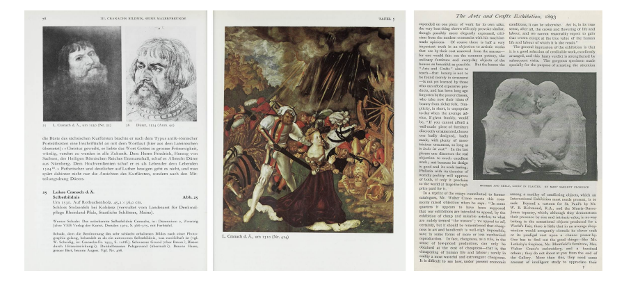
Fig. 1. Dataset Samples

important entities of the cultural heritage domain, such as artworks. Due to the ambiguities that are inherent in artwork titles, the identification of their mentions from texts is a challenging task and requires significant domain expertise to tackle. Consider the painting with the title ' Head of a woman ' — such phrases can be hard to get distinguished as named entities from the surrounding text due to their generality. Even the presence of typical formatting cues such as capitalization, quotes, italics or boldface fonts cannot be assumed or guaranteed, especially in digitized texts obtained from scans of art historical archives. The issue of noisy data due to OCR limitations further exacerbates the challenges for automated text analysis for the cultural heritage domain [18].