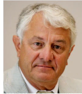
Prof. Dr. h.c. Hasso Plattner

SAP and Hasso Plattner Institute, Germany