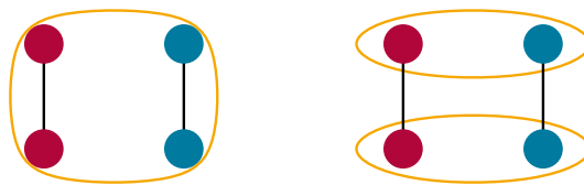
■ Figure 1 Example forest where a cluster of size 4 and two clusters of size 2 incur the same cost. With one cluster of size 4 (left), the inter-cluster cost is 0 and the intra-cluster cost is 4. With two clusters of size 2 (right), both the inter-cluster and intra-cluster cost are 2.

our algorithms and hardness results for certain graph classes and color ratios. We further show that the hardness of fair clustering does not stem from the requirement of the clusters exactly reproducing the color distribution of the whole graph. This section is concluded by a discussion of possible directions for further research.