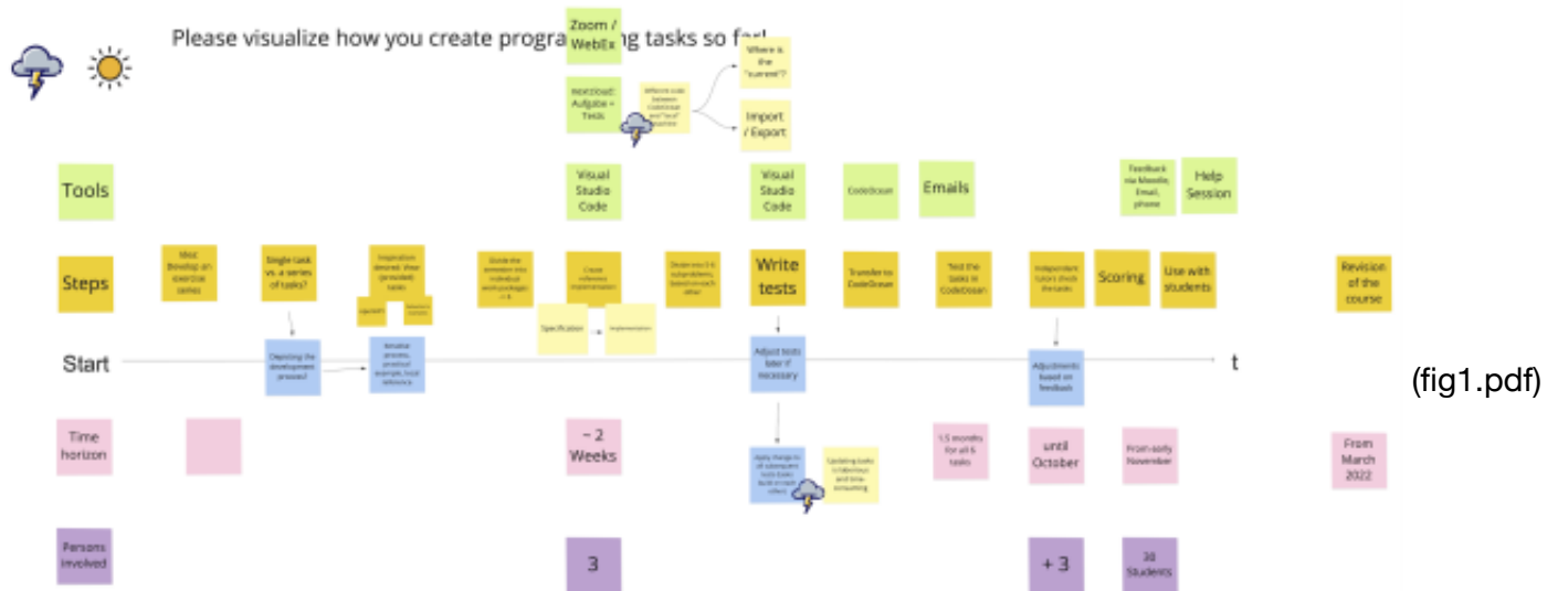
Fig. 1. An exemplary user journey as created during the second interview. The interviewee reflected on the various steps needed to create an exercise (in yellow) or update them (in blue), along with the different tools used (in green), the time horizon (pink) and the number of persons involved (purple).

Generative User Research Part. The generative user research part aimed to identify potential requirements for the platform by gaining knowledge about teachers’ problem space and areas that provide possibilities when preparing learning material for their classes. We used semi-structured interviews along with the participatory user research methods of user journeys and card ranking as described by Alsos and Dahl [AD09]: In each interview, the interviewees created a user journey in collaboration with us to depict the interviewees’ experiences with creating programming tasks for their students, showcasing the highlights and pain points of their process. An example of this user journey is shown in Figure 1. Following this, the interviewees conducted a card ranking exercise: They ranked the features they deemed necessary for a task exchange platform based on their importance.