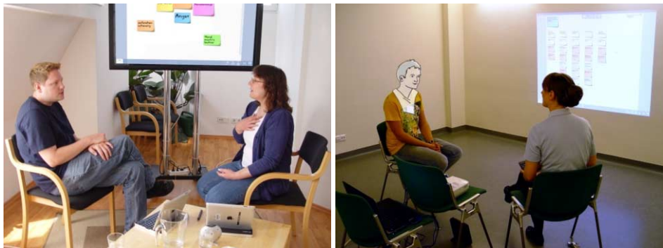
Figure 1. Therapy session scenes with patient, therapist and different versions of the TBM hardware setup. The documentation panel is shown on a digital whiteboard (left) or as a projection on a wall (right).

The medical documentation system Tele-Board MED builds on Tele-Board, a web-based software system to support creative teamwork [6]. It can be used on a lot of different hardware devices, such as digital whiteboards, laptops, as well as desktop and tablet computers (cf. fig. 1). Patient files can be created and filled with documentation panels. These panels serve as a working space that can be freely edited. The existing features are inspired by analogue whiteboard interactions, such as creating sticky notes, drawing scribbles, including pictures and arranging contents. The users can start with an empty panel or use one of the numerous prepared templates, e.g. with psychotherapy analysis schemes (cf. fig. 2). Figure 1 shows session scenarios where documentation panels are displayed and jointly filled by patient and provider during their discussion.