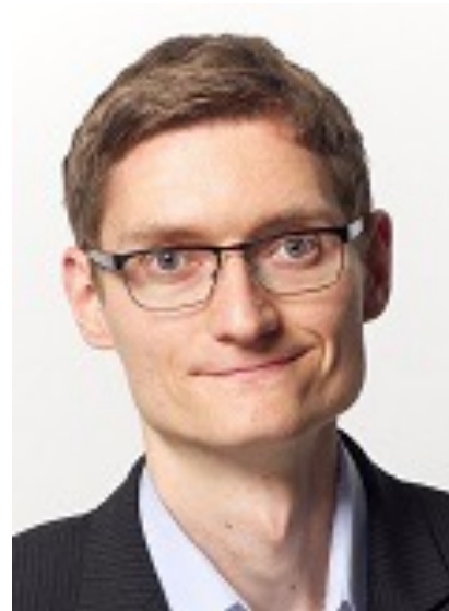
CEO of SSE Technologies