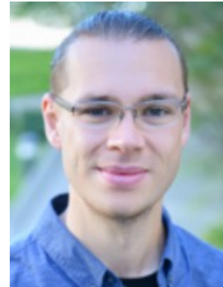
CTO of SSE Technologies