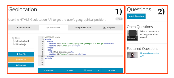
Fig. 3. User Interface for the Student

For participants, the user interface of our prototype presents itself as shown in Figure 3.