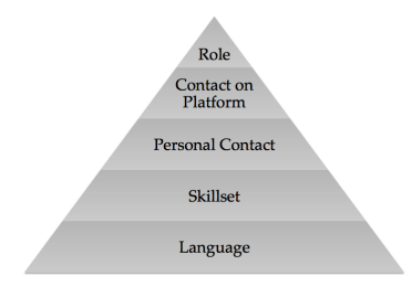
Fig. 4. Factors for Optimal Tutoring

We conducted several qualitative interviews as well as 3 quantitative surveys with a varying number of participants and questions. The first small study was conducted in a controlled environment and had participants. eleven students and voung professionals, use the tool for different tasks. We asked them for their perception which factors would be most important for an optimal tutoring. The overall result can be seen in Figure 4. As a basis, so of highest importance, the participant - tutor pairs have to share a common language and participants wish to have the tutor to have mastered the skillset to be learned. On top of that, students then prefer tutors that they had contact with, for example in person, in prior sessions or in forum discussions. Ranked of least importance was the user role, meaning the position and occupation within a course, so being a student, an entitled teaching assistant or part of the core group actually conducting the course. When presenting potential questions for tutors, these considerations should be represented in the pairing and ranking algorithms.